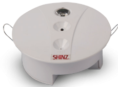
RECESSED MOUNT 0.241 Kg/Unit 30 Units/Carton