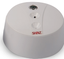
SURFACE MOUNT 0.296 Kg/Unit 30 Units/Carton